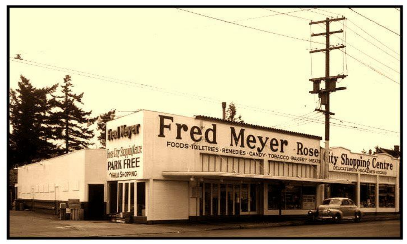
The Fred Meyer Rose City Shopping Centre at 72nd and NE Sandy Boulevard opened in the 1940's.