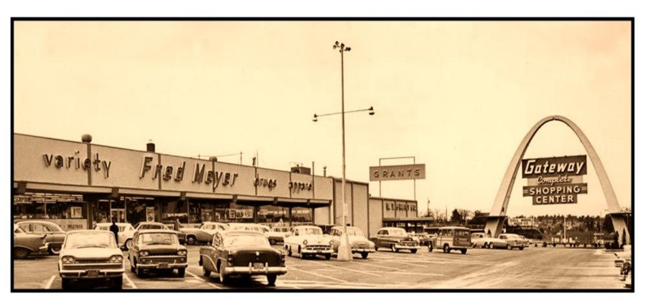
Gateway Fred Meyer in the 1950's.